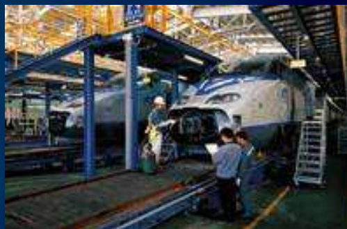
Rolling Stock Depot (KTX)