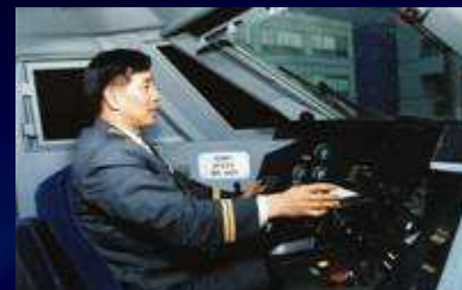
Transport (KTX Driver)