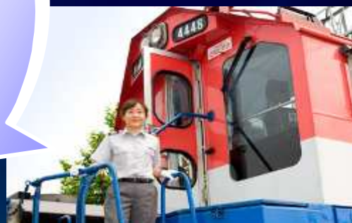
Transport Conventional Line)